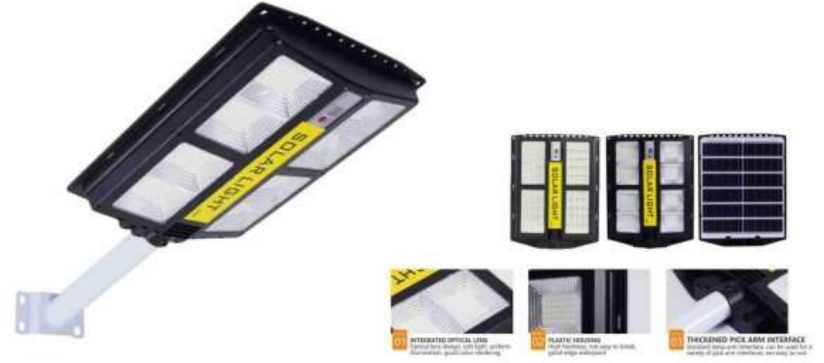
01 INTEGRATED OPTICAL LENS Optical lens design, high light uniformity, high efficiency, good color rendering. 02 PLASTIC HOUSING High efficiency, long life span, low temperature coefficient. 03 THICKENED PCB ARM INTERFACE Thickened PCB arm interface, can be used for a variety of pole arm sizes, easy to install.