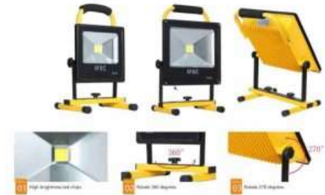
01 High brightness and chips 02 Includes 360 degrees 03 Includes 170 degrees