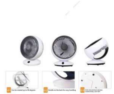
01 Can be rotated up to 90 degrees 02 Handle on the back for easy handling 03 Anti-collision and fan, hidden safety, anti-fan