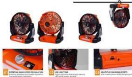
01 ROTATING WING LEAFS REGULATION: Rotating blades can adjust the speed of the fan and the angle of the fan. 02 LOW LIGHTING: Low light level and energy saving LED light source, 100%. 03 MULTIPLE CHARGING PORTS: With USB and Type C, the fan can be charged in two ways.