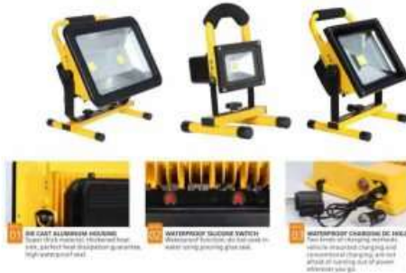
01 THE BEST ALUMINUM ALLOYING Light is 100% aluminum, excellent heat dissipation, excellent heat dissipation performance, high performance of heat. 02 WATERPROOF SLIDING SWITCH Waterproof switch, no risk of water being sprayed, great safety. 03 WATERPROOF CHARGING DE FEEL Two levels of charging protection, vehicle impacted charging and protection of charging, will not affect the working state of power when the car is on.