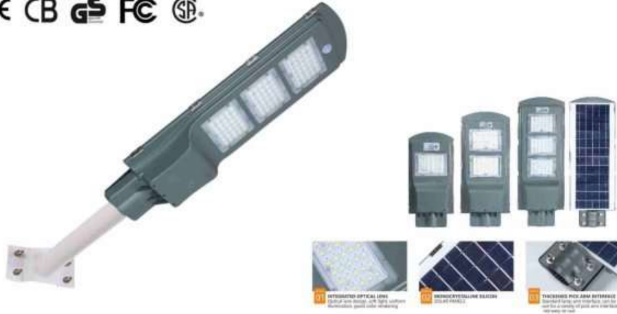
01 INTEGRATED OPTICAL LENS Optical lens design, high light uniformity, high efficiency, good color rendering. 02 MONOCRYSTALLINE SILICON SOLAR PANEL High efficiency, long life span, low temperature coefficient. 03 THICKENED PCB ARM INTERFACE Thickened PCB arm interface, can be used for a variety of pole arm sizes, easy to install.